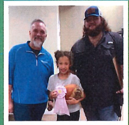
2023 MARION COUNTY 4-H COUNTRY HAM DAYS CONTEST RESERVE CHAMPION COUNTRY HAM