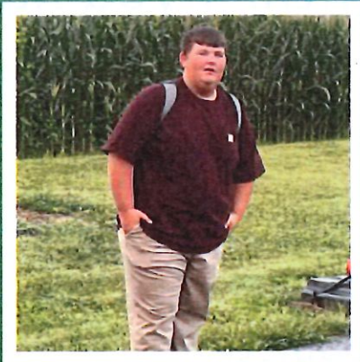
2023 MARION COUNTY 4-H COUNTRY HAM DAYS CONTEST GRAND CHAMPION COUNTRY HAM